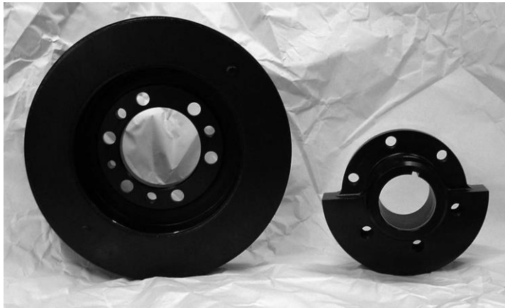
Damper Ring (A)

BALANCING OR MATCH BALANCING -Fluidamprs designed for externally balanced engines include the damper ring (A) bolted to a counter-weighted hub (B). See photo below.